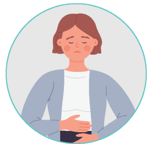
Nausea, vomiting or diarrhea